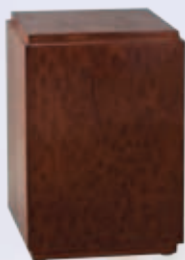
Burlwood Summit $135