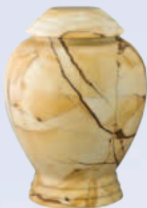
Pedestal Stonewood $130