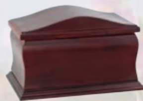
Scala Two $120