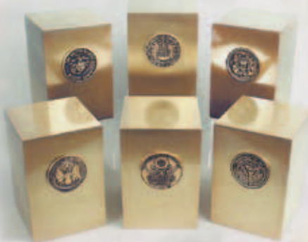
Bronze Military $285