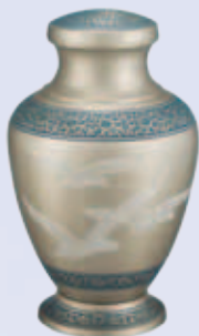
Silver with Doves $135