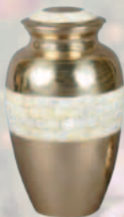
Mother of Pearl $120