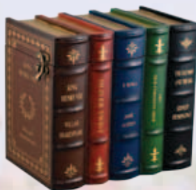
Bookset Urn $95