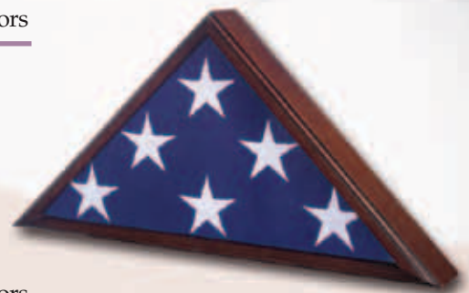
Flag Case Memorial Cherry $85

Veterans options are also available to spouses and handicapped children of veterans.