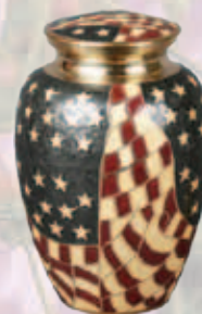
Old Glory $120

Samples pictured - Choose from our wide selection of available urns.